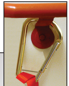
FIG. 6b Closeup of hook attached to railing bracket